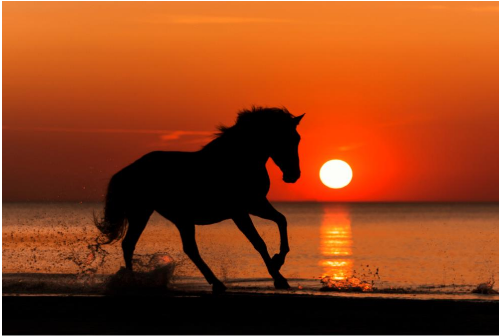
Andalusian thoroughbred running free on a beach