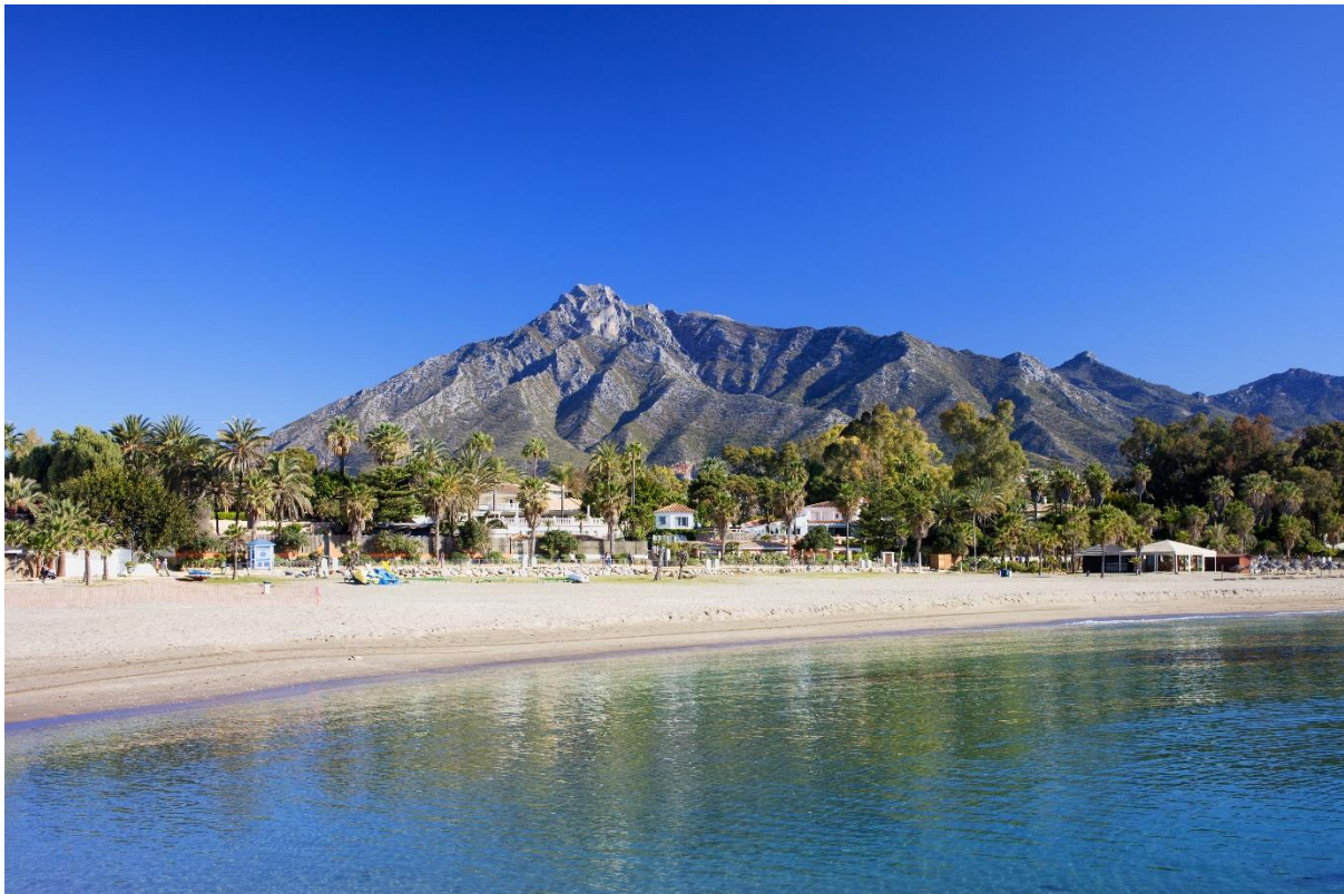
The bewitching La Concha mountain. Marbella is Andalusia's flagship of luxury tourism.

Buying and Owning Spanish Property through Companies: Pros and Cons – 7th March 2014